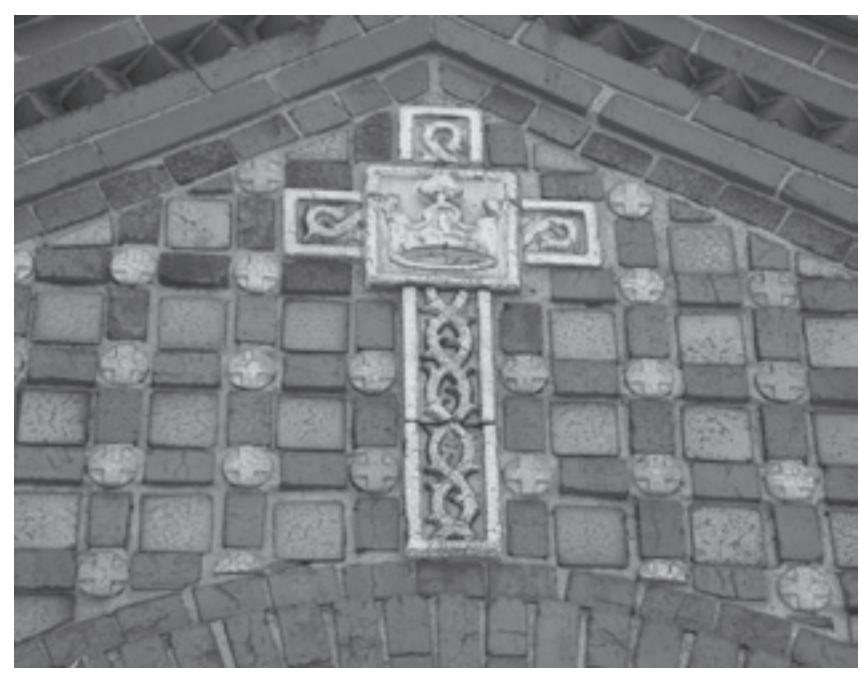
Decorative Cross over Clinton Street Entrance